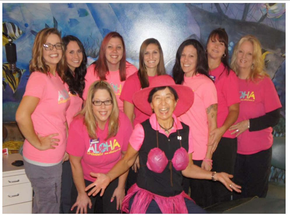
ALOHAs PINK OUT TO SHOW OUR SUPPORT